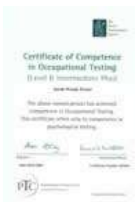
BPS Certificate Level B Intermediate Plus. British Psychological Society Level B Intermediate Plus Certificate in Competence for Occupational Testing February 2009