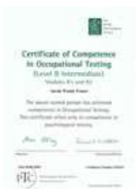
BP Level B Certificate: BPS Certificate Level B. British Psychological Society Level B Certificate in Competence for Occupational Testing February 2009